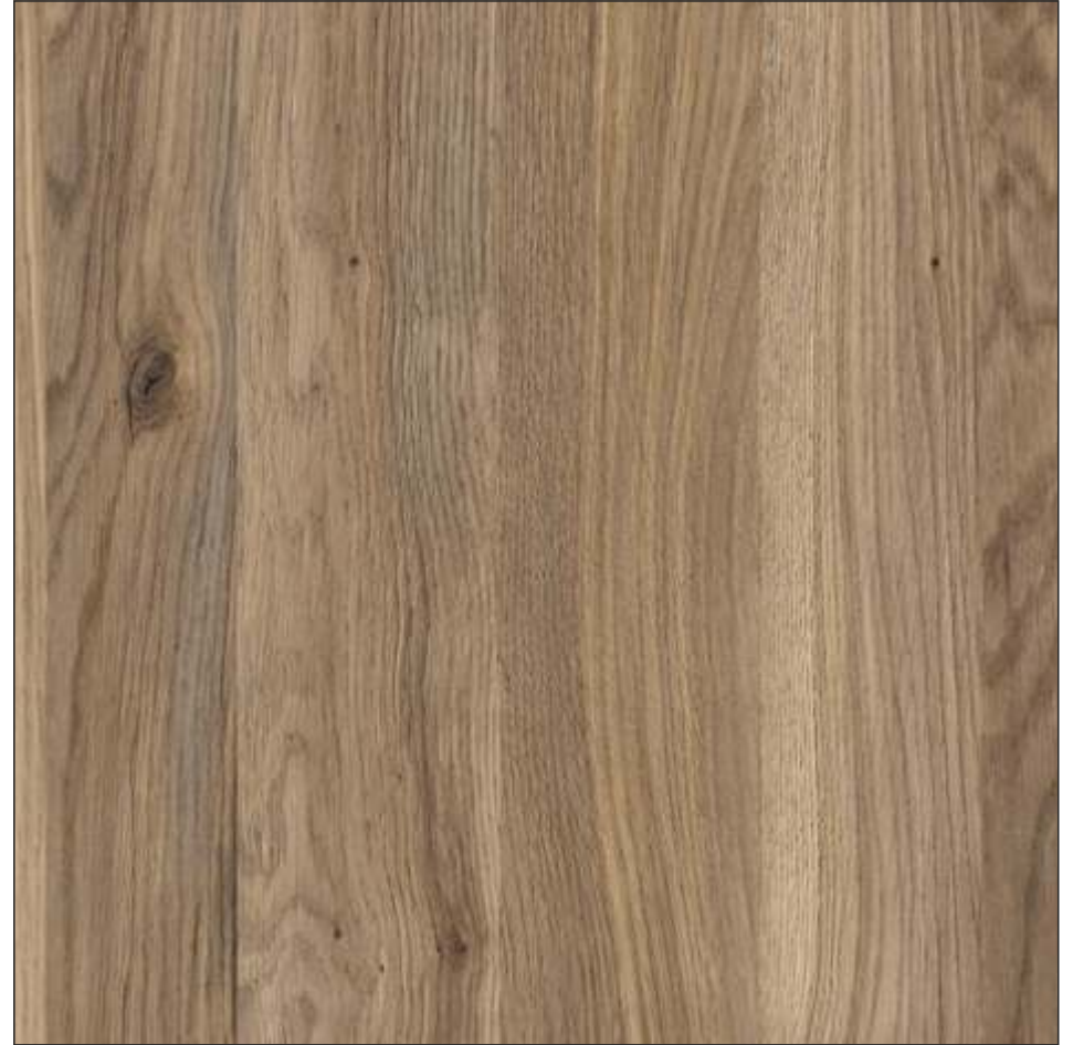
15071 | Mauvella Oak