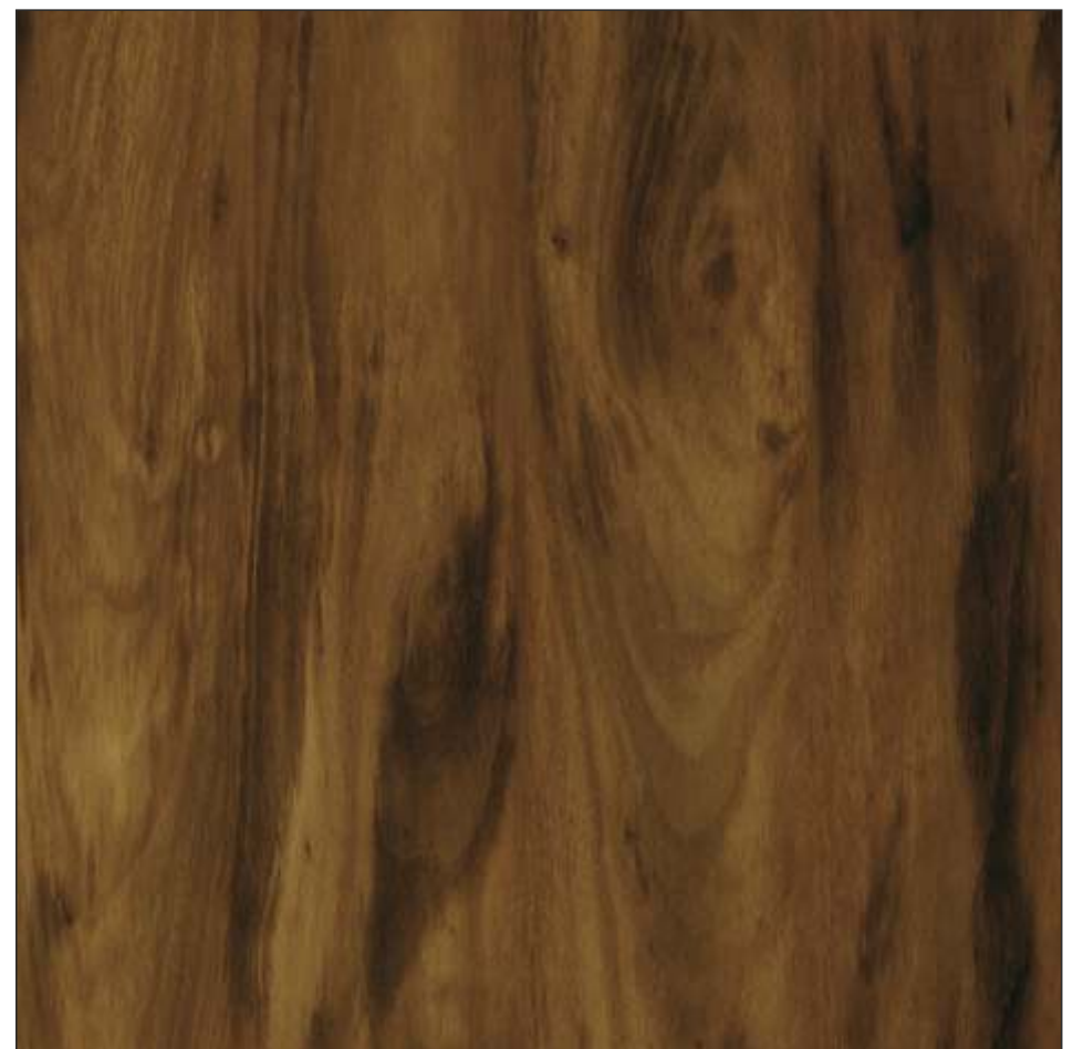
15077 | Oak Coffee Brown Dark