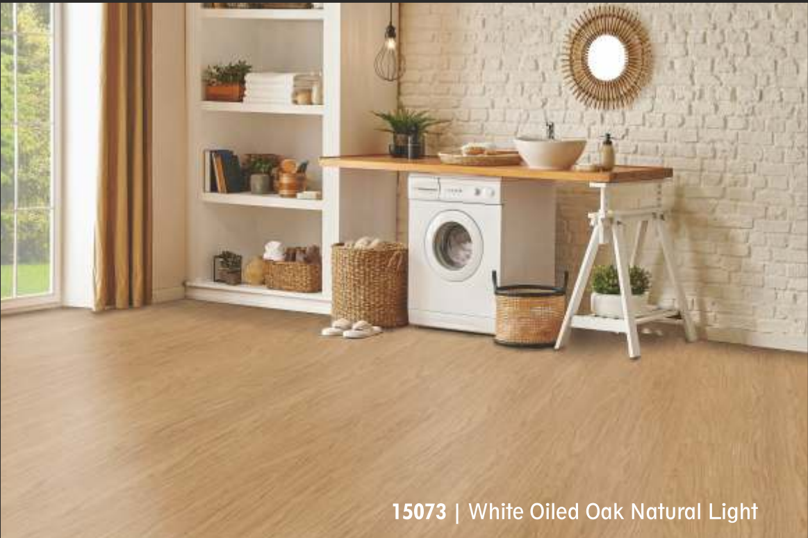
15073 | White Oiled Oak Natural Light