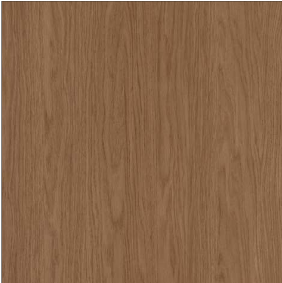
15074 | White Oiled Oak Natural Brown