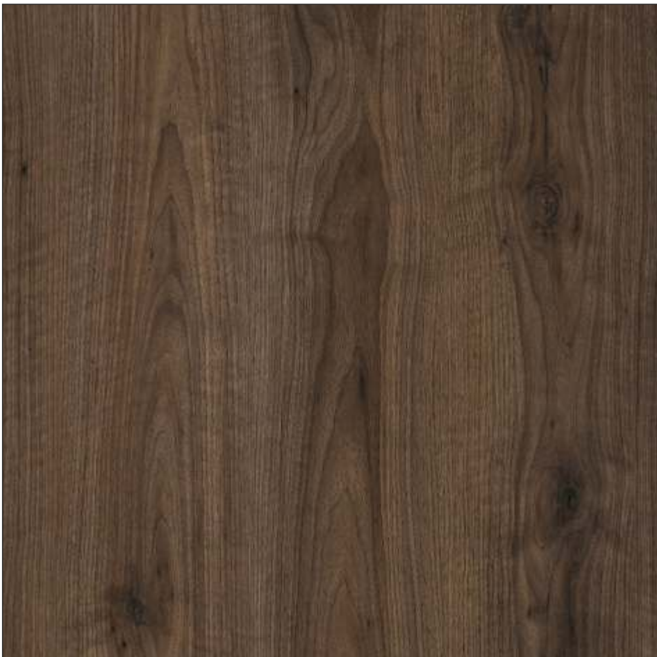
15068 | Girona Walnut Brown