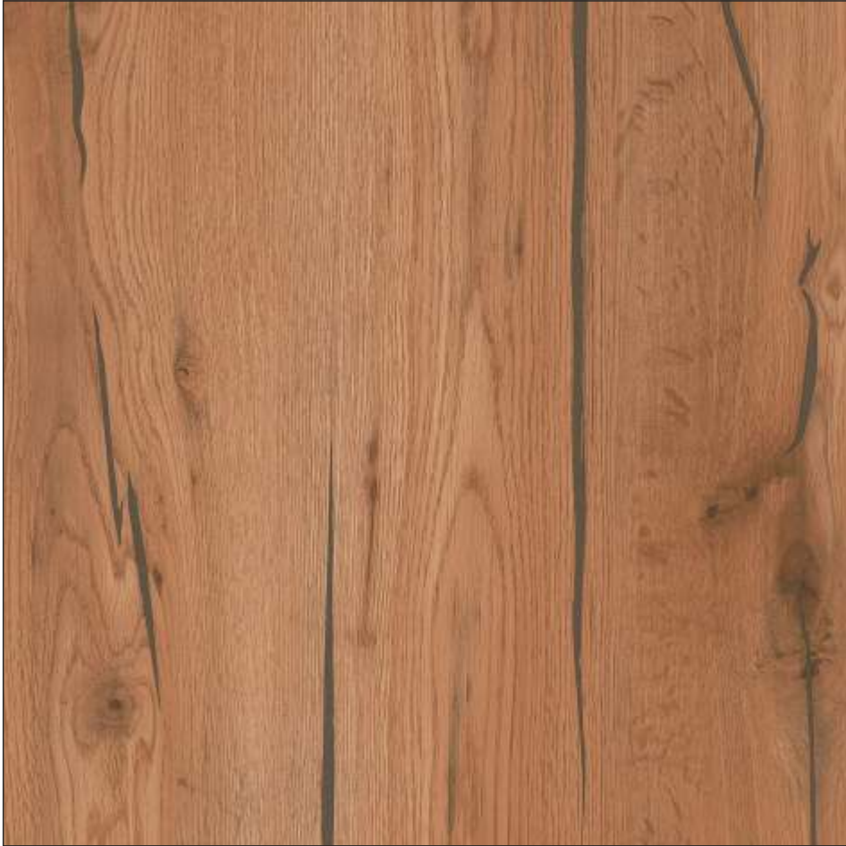
15066 | Chatham Oak