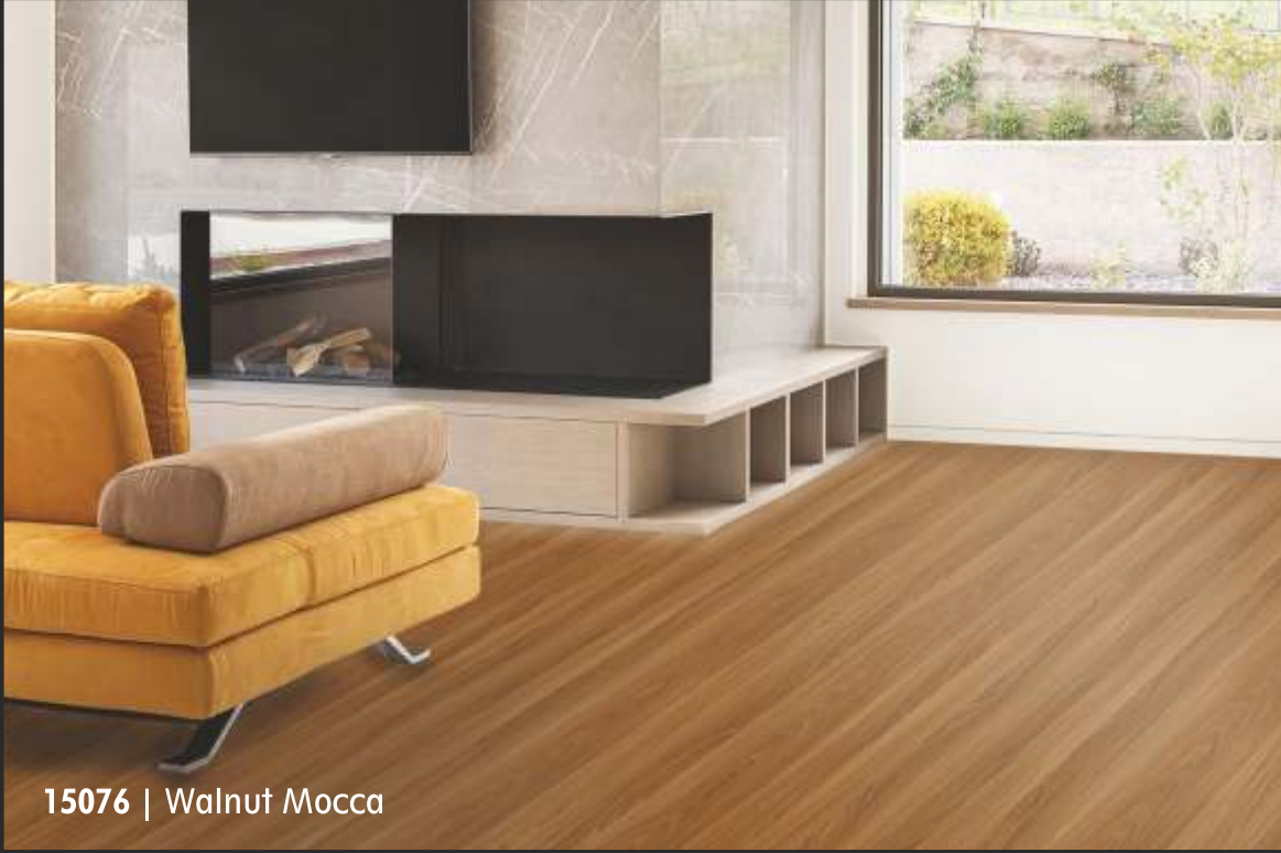
15076 | Walnut Mocca