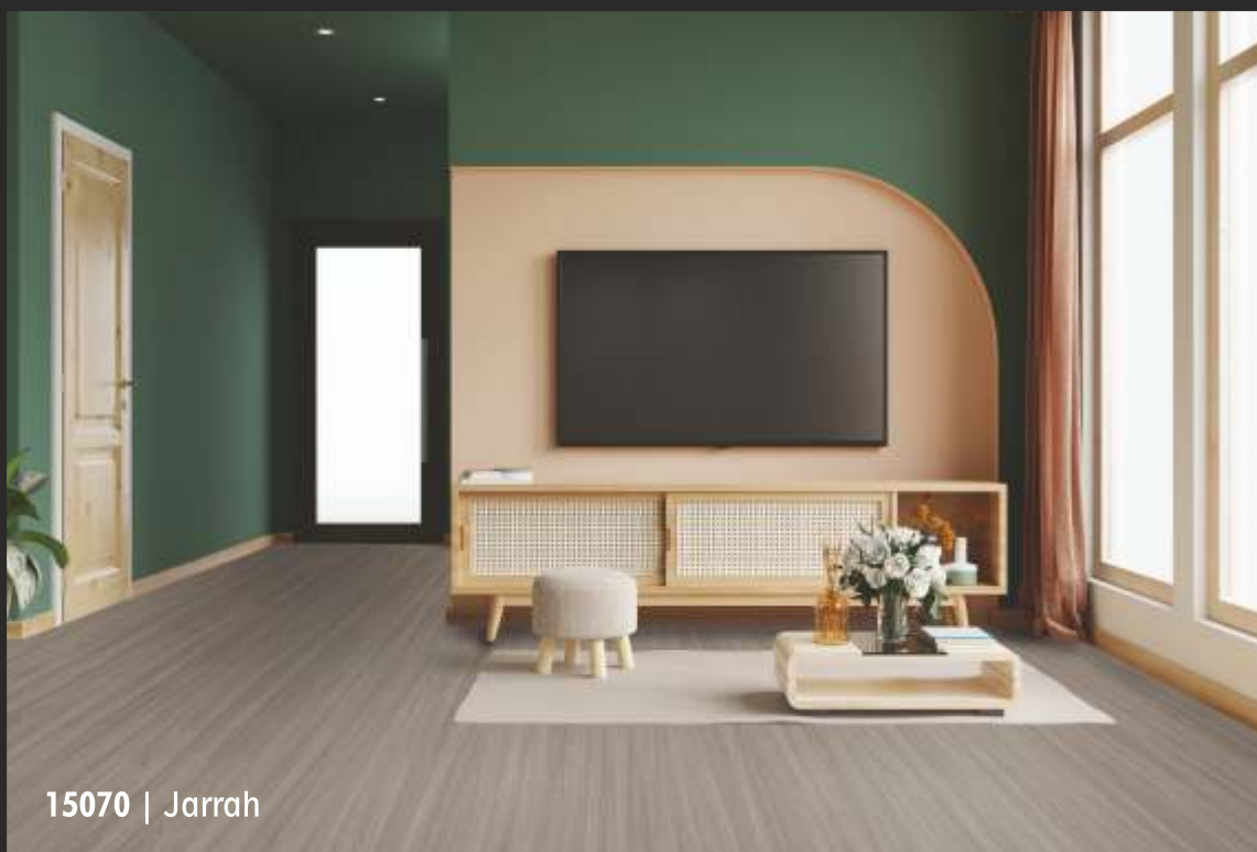
15070 | Jarrah