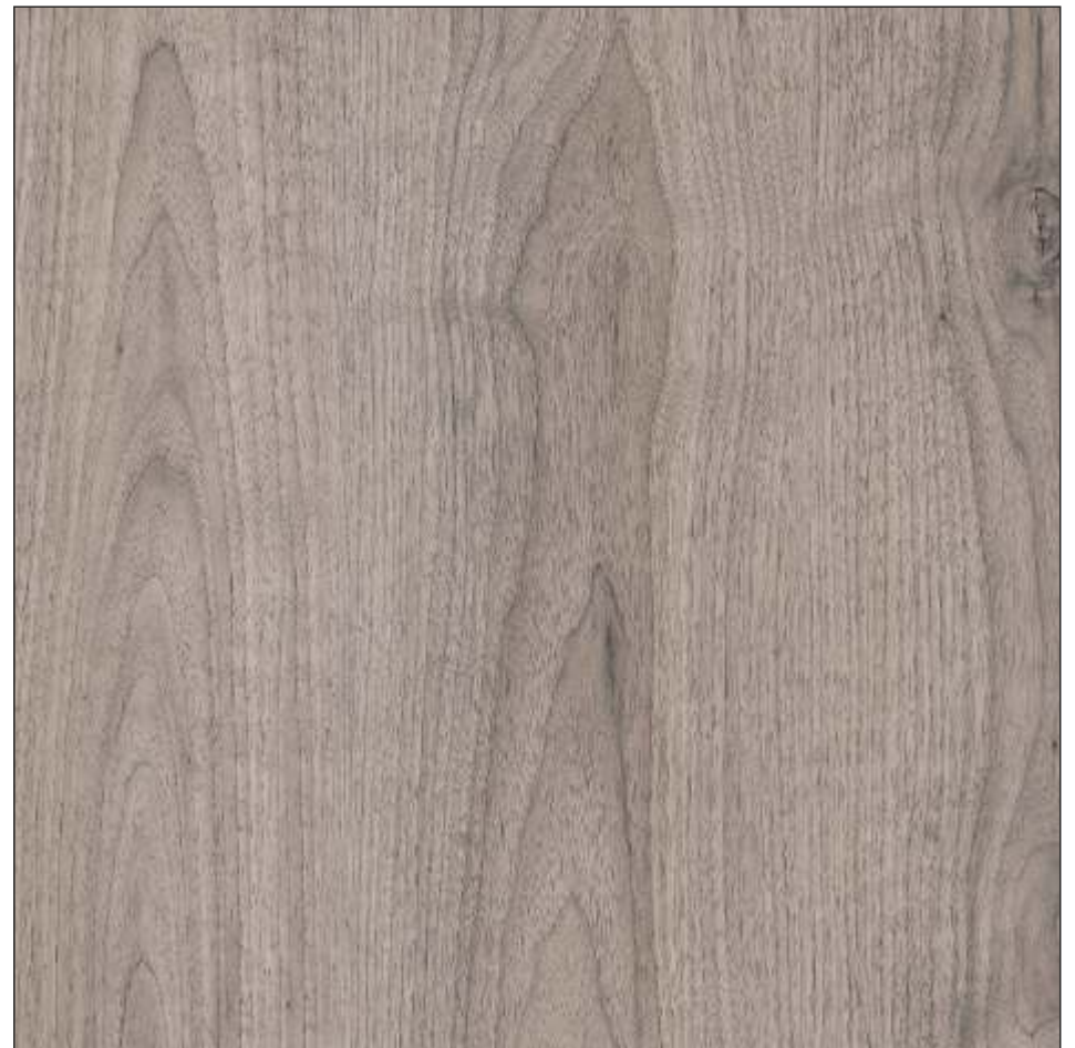
15069 | Girona Walnut Grey