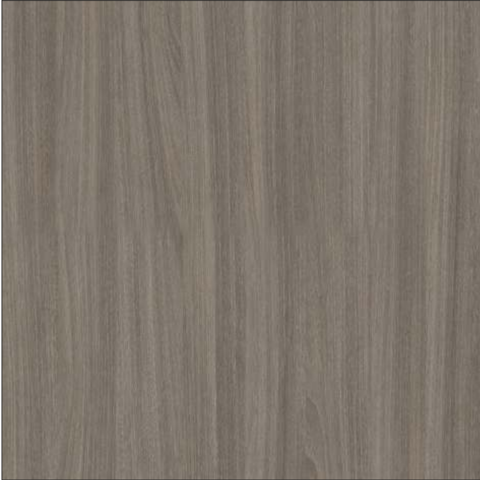
15070 | Jarrah