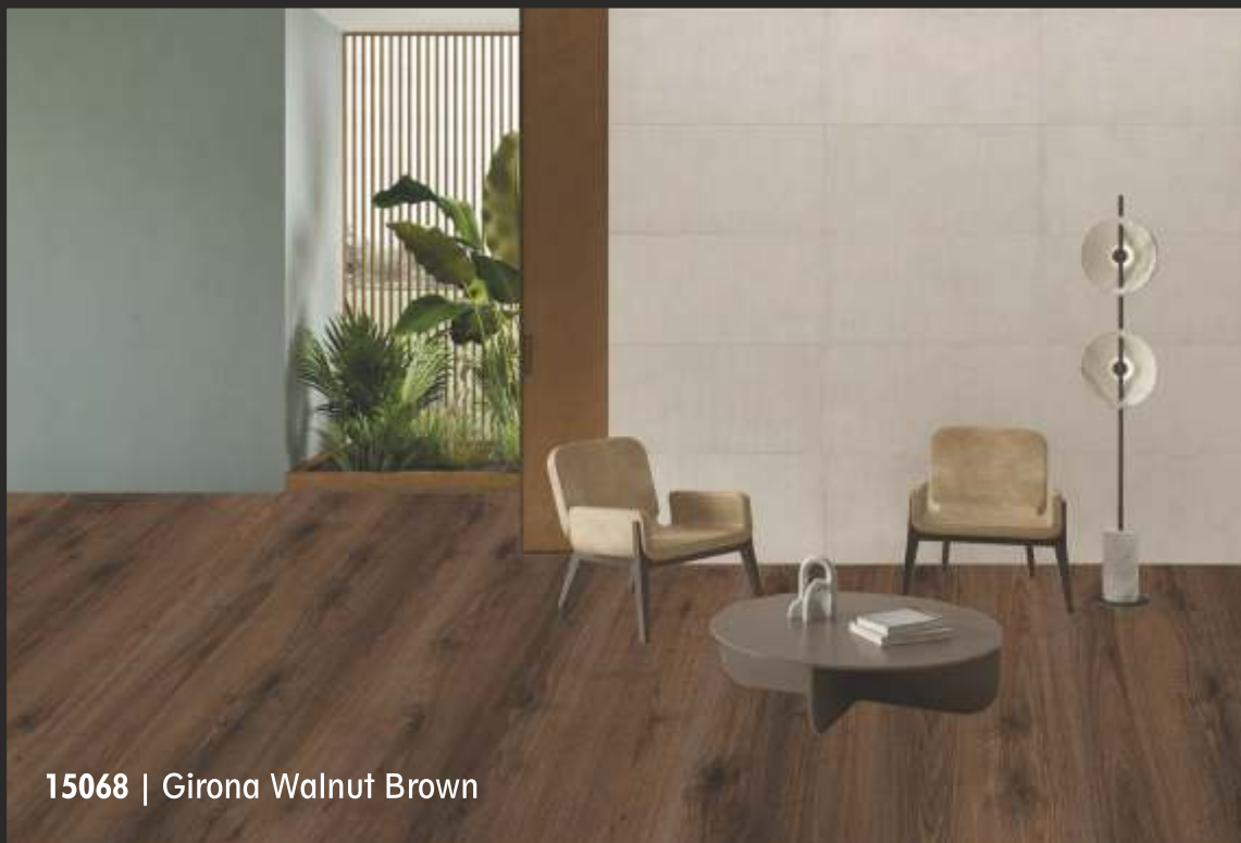
15068 | Girona Walnut Brown