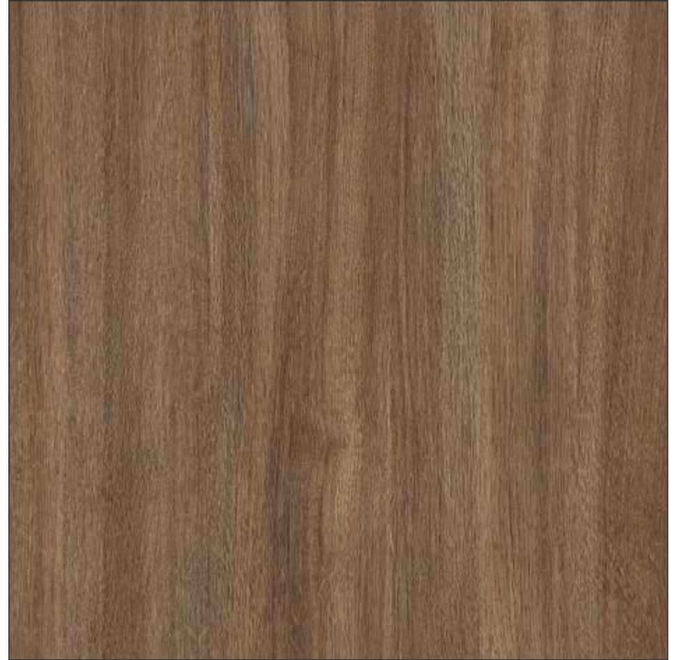
15067 | Clashmoore Oak