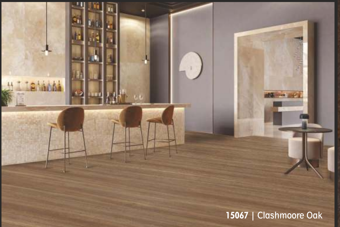
15067 | Clashmoore Oak