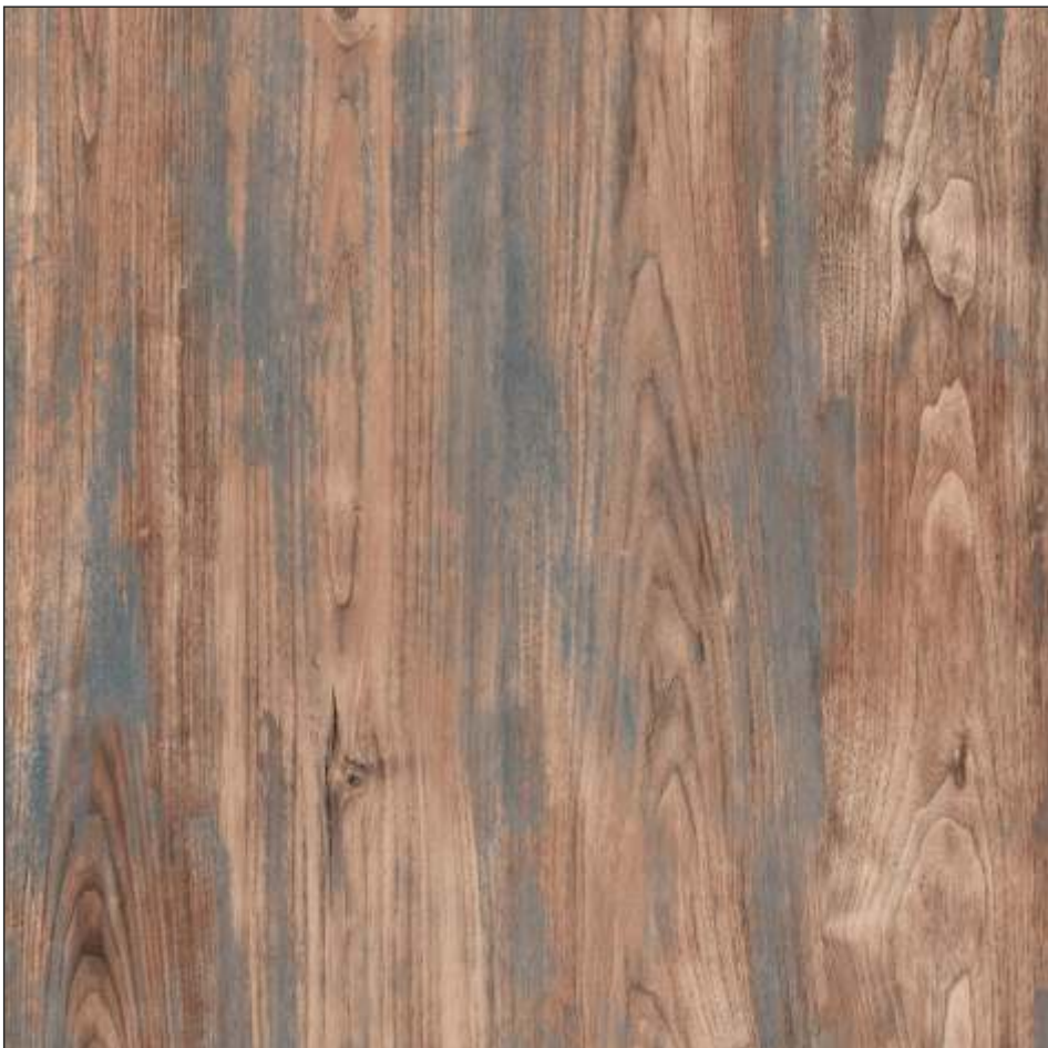
15072 | Pembroke Walnut