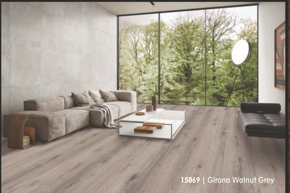
15069 | Girona Walnut Grey