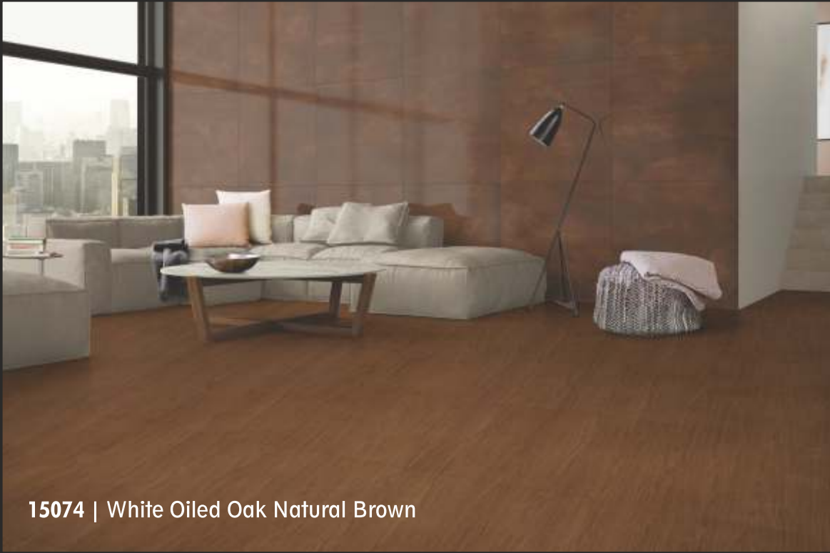
15074 | White Oiled Oak Natural Brown