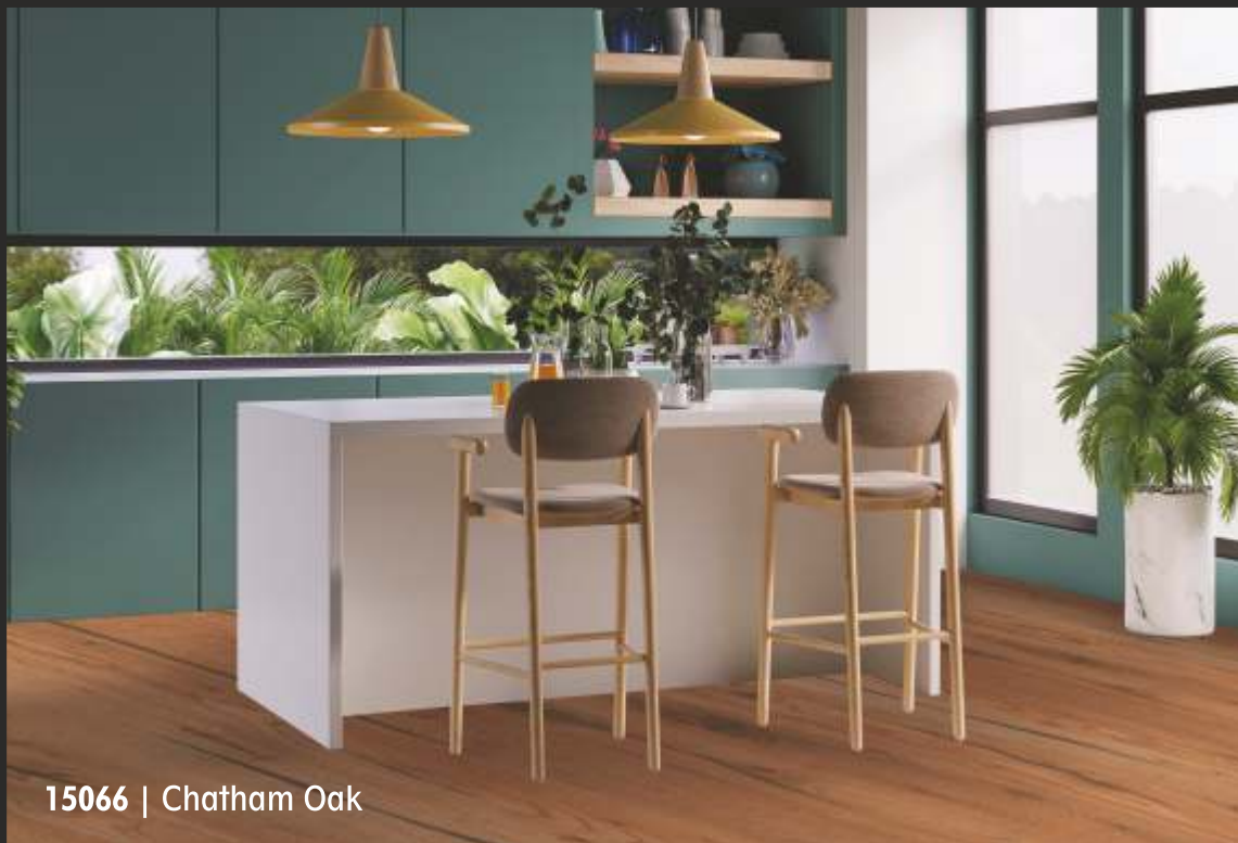
15066 | Chatham Oak