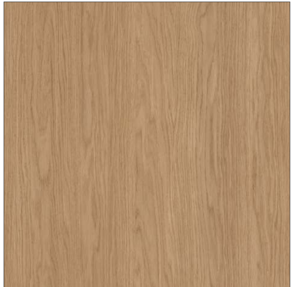
15073 | White Oiled Oak Natural Light