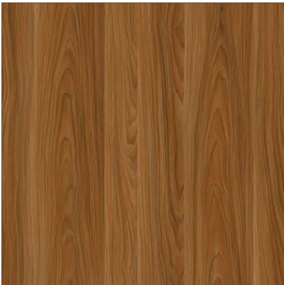
15076 | Walnut Mocca