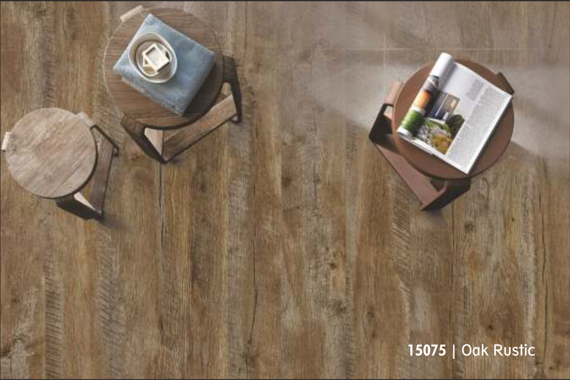
15075 | Oak Rustic