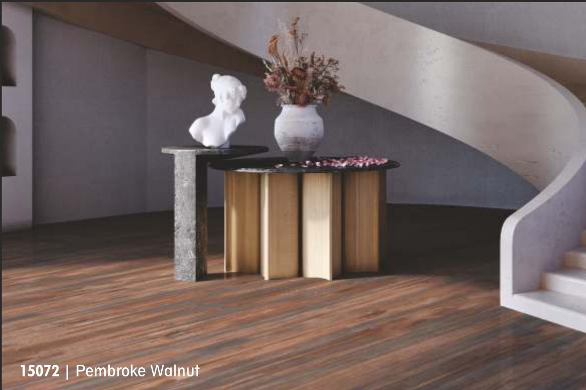
15072 | Pembroke Walnut