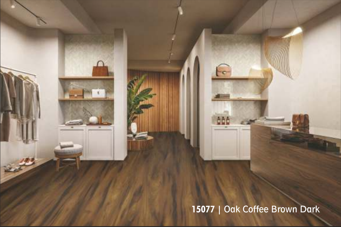
15077 | Oak Coffee Brown Dark