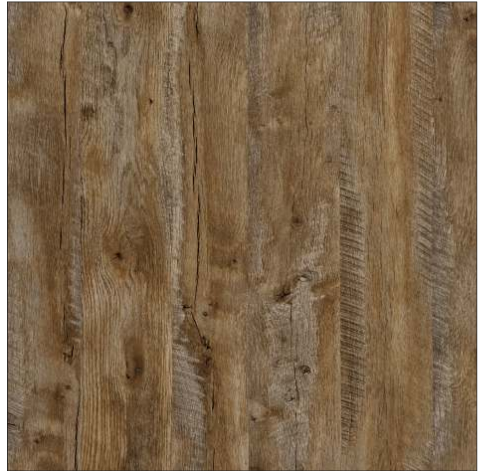
15075 | Oak Rustic