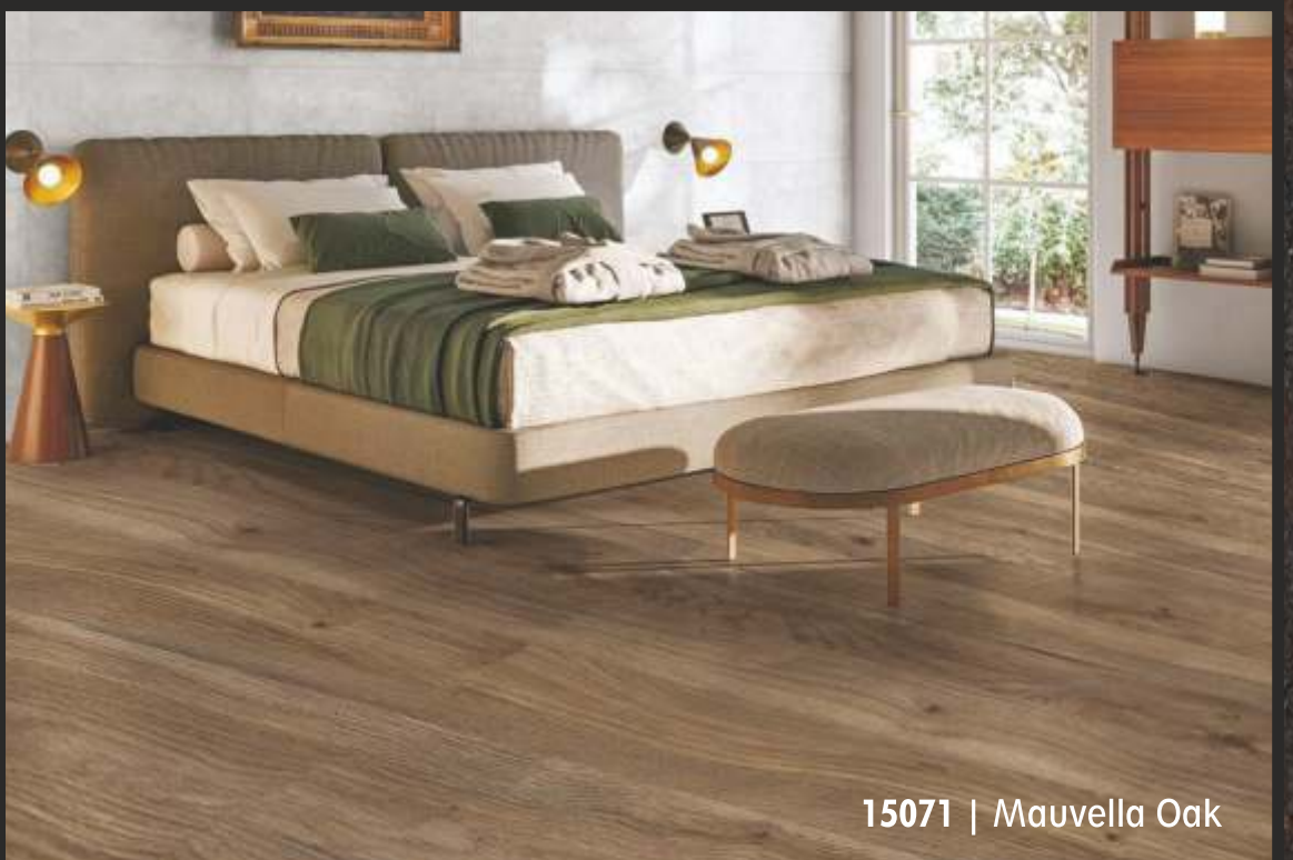
15071 | Mauvella Oak