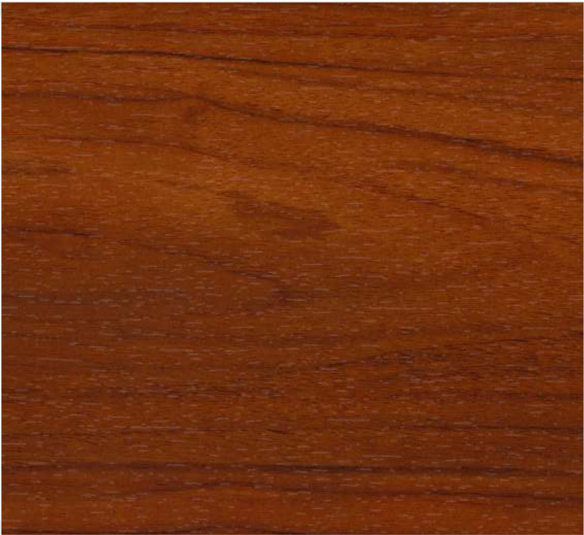
15056 # CHERRY TENNESSEE