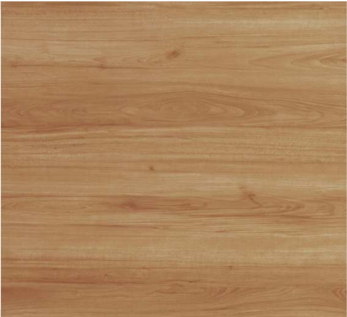
15052 # LATIN WALNUT LIGHT