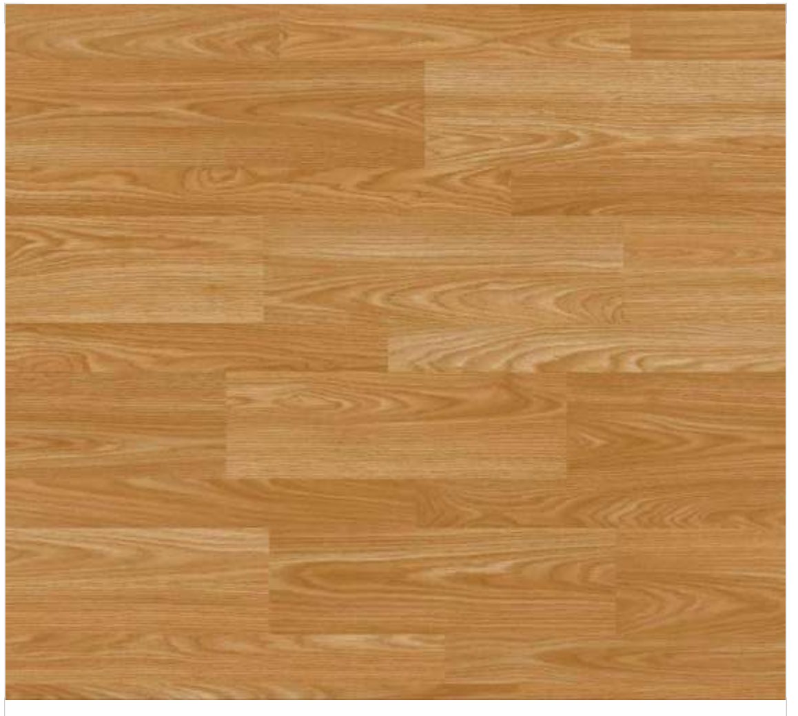
15024 # PERFECT OAK