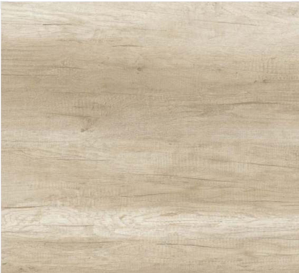
15016 # CANYON MONUMENT OAK LIGHT