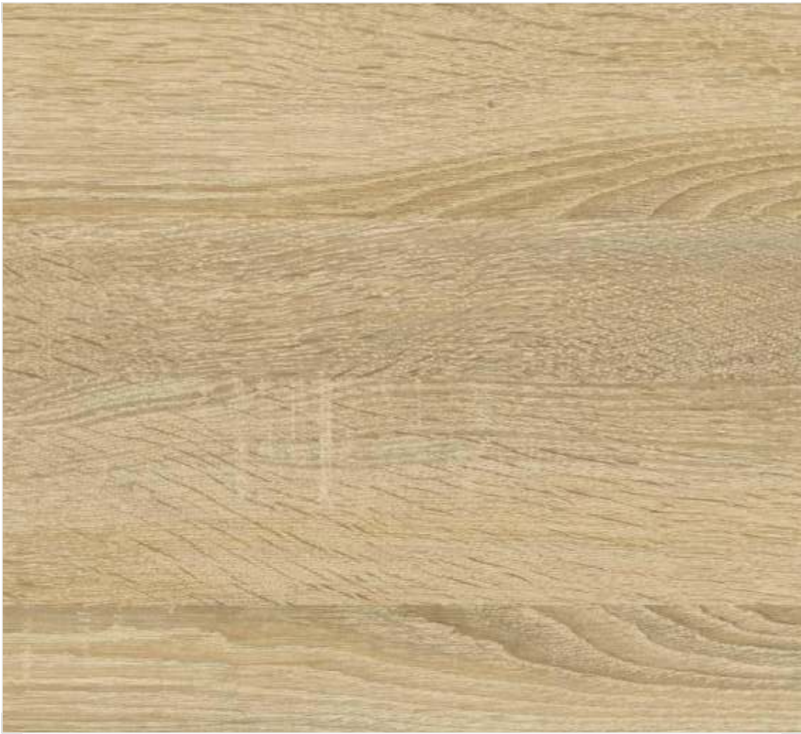
15013 # SONOMA OAK LIGHT