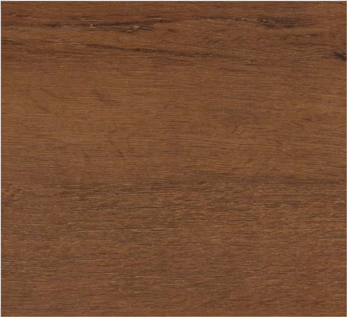
15065 # OLD SCHOOL OAK