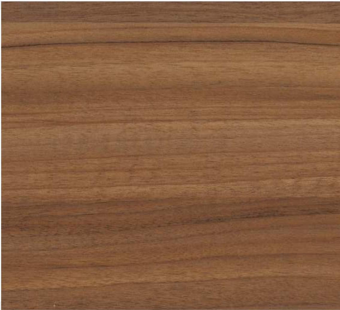
15055 # BROWN RIMINI WALNUT