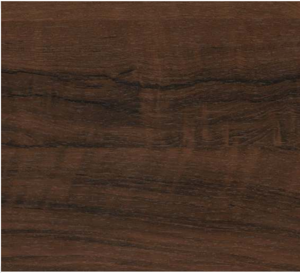
15053 # ABSOLUTE WOOD DARK