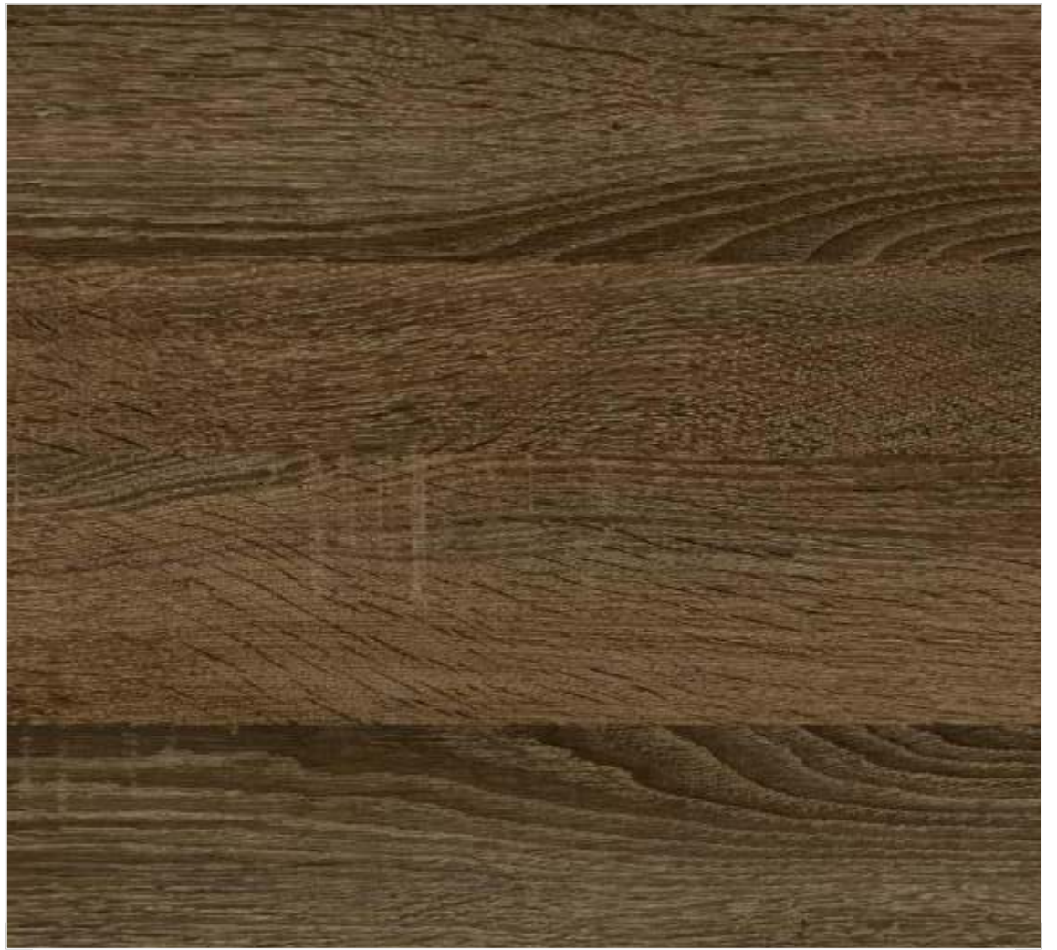
15014 # SONOMA OAK DARK