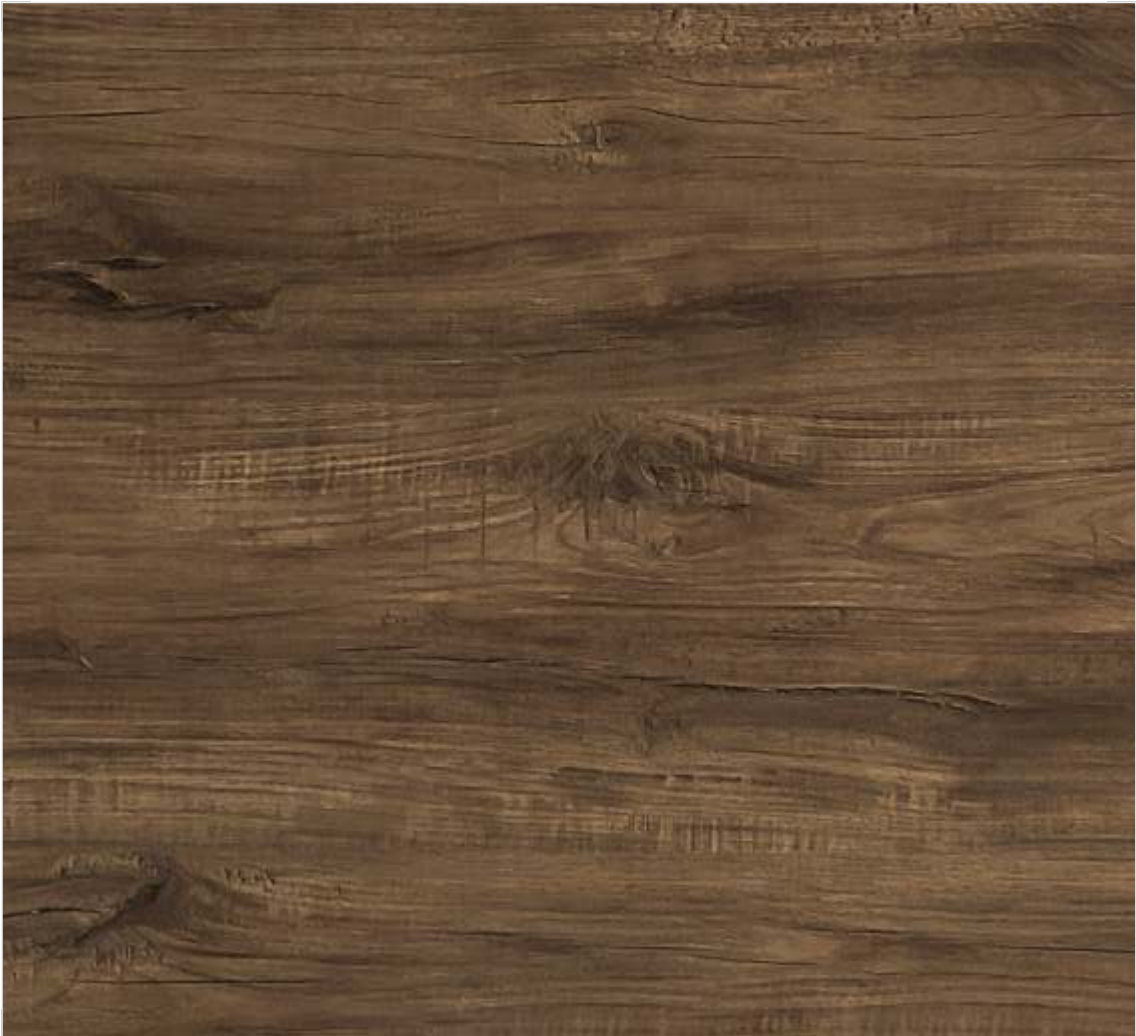
15062 # CANYON WOOD BROWN