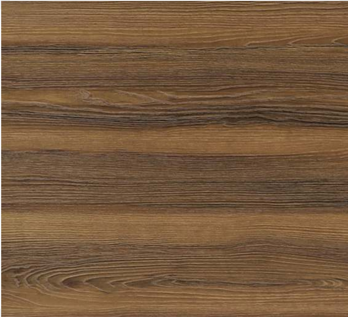
15061 # SYNC OAK BROWN