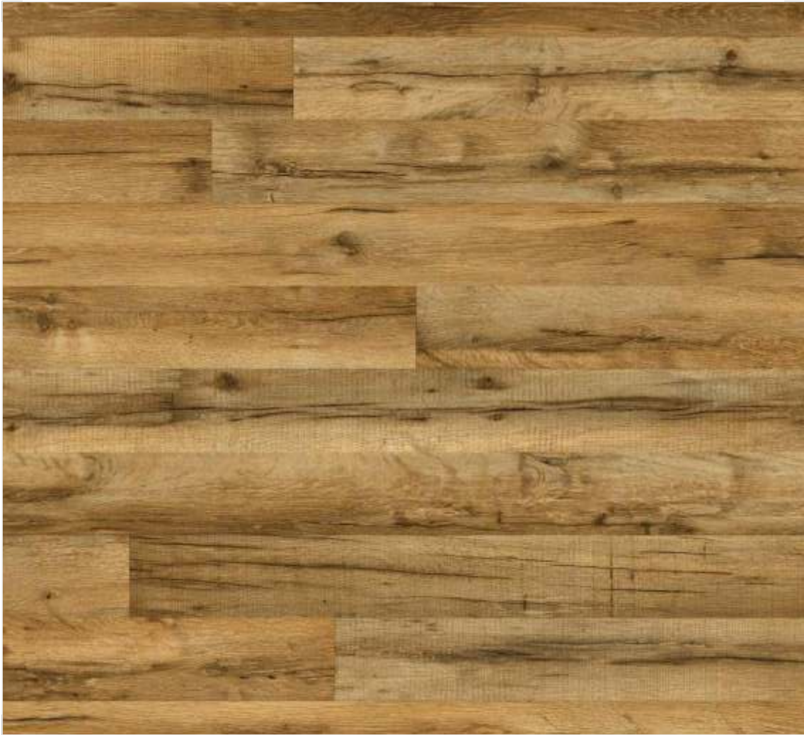
15006 # TAVERN OAK BROWN