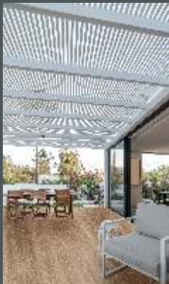
VILLAS & HOMES